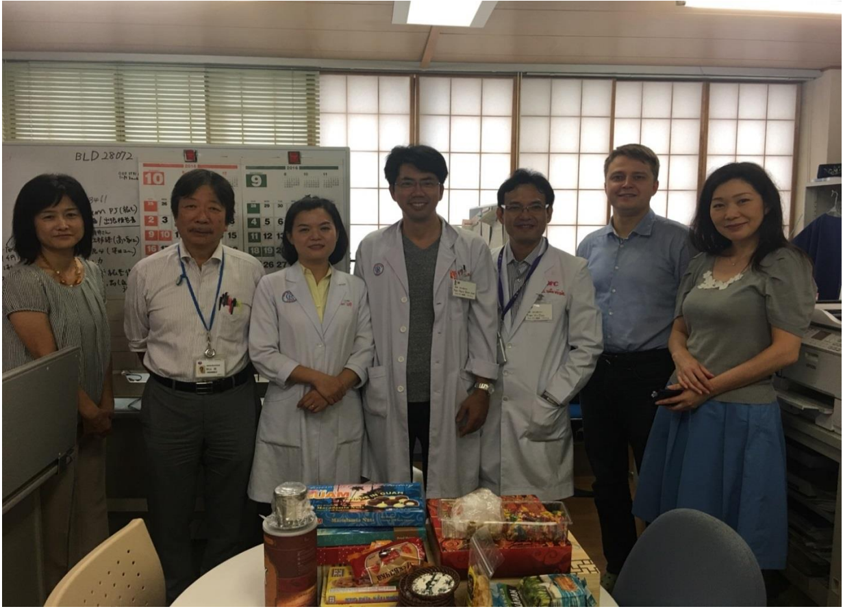
Photo at IMC room