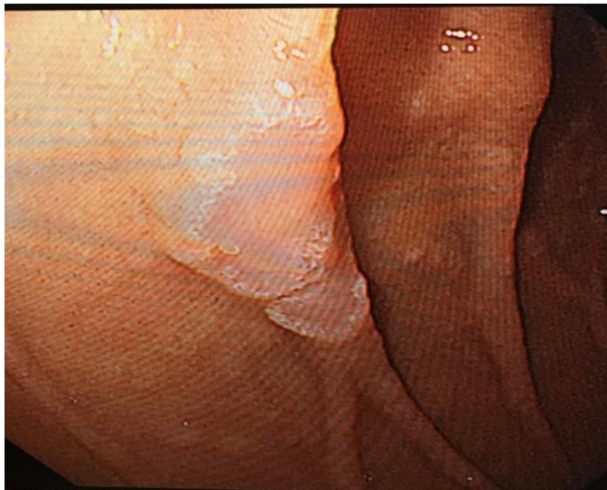
Early Duodenum Cancer

Thank you very much for all your supports. I have had the great stay in Tsukuba. I did really enjoy it.