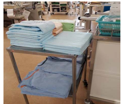
A neat and clean workplace