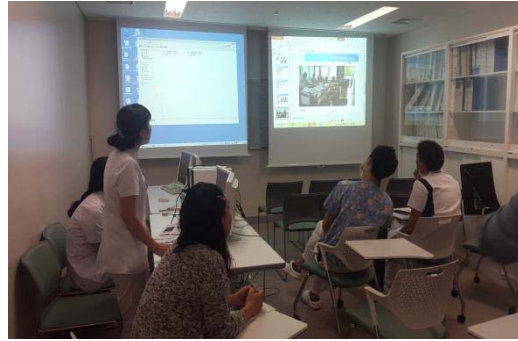
Meeting with term nurse ICU