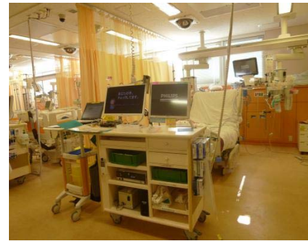
Modern equipments are organized