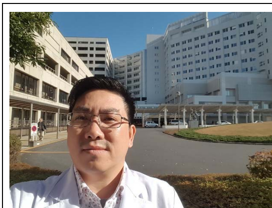
Visit University of Tsukuba Hospital