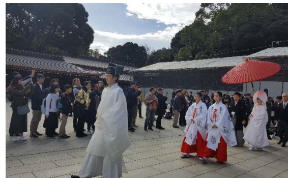
The Japanese Wedding