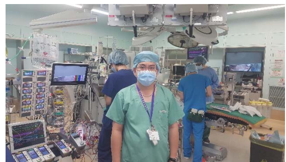
Preparation before operation